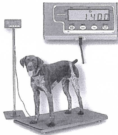
Shown with optional floor stand