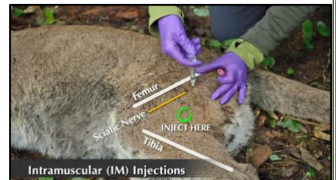
Intramuscular (IM) Injections